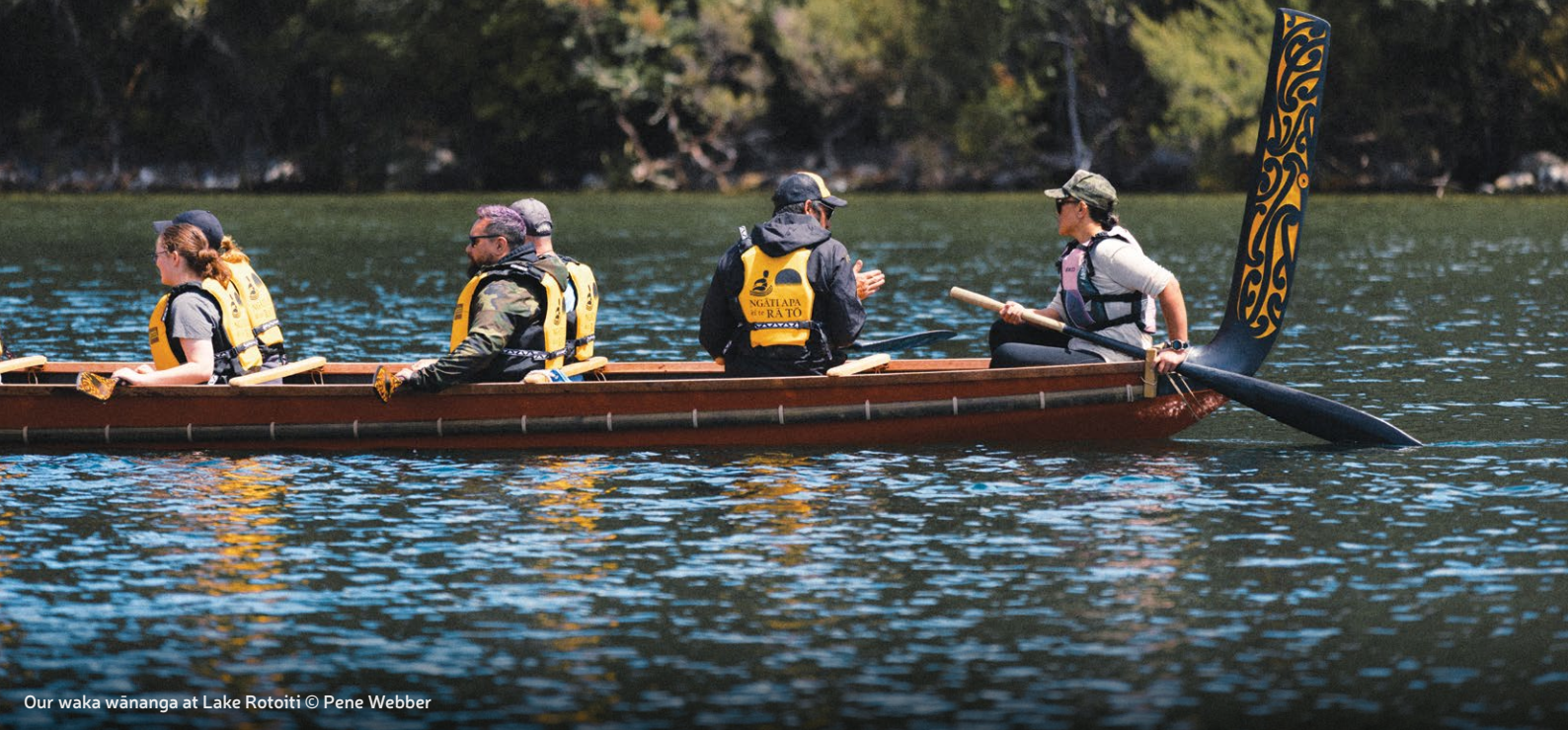
Our waka wānanga at Lake Rotoiti