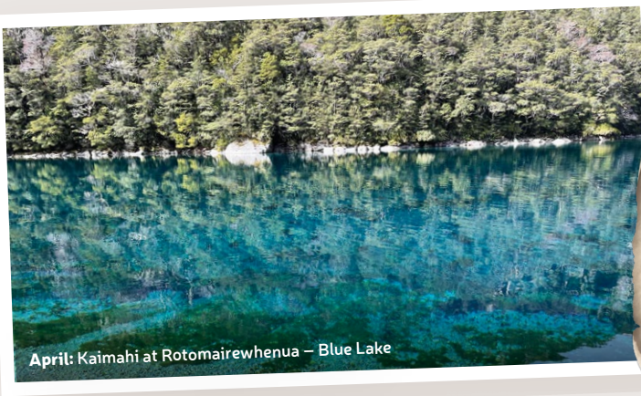
April: Kaimahi at Rotomairewhenua – Blue Lake