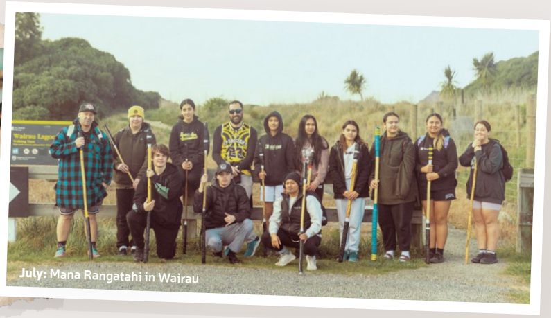
July: Mana Rangatahi in Wairau