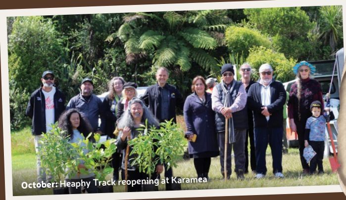
October: Heaphy Track reopening at Karamea