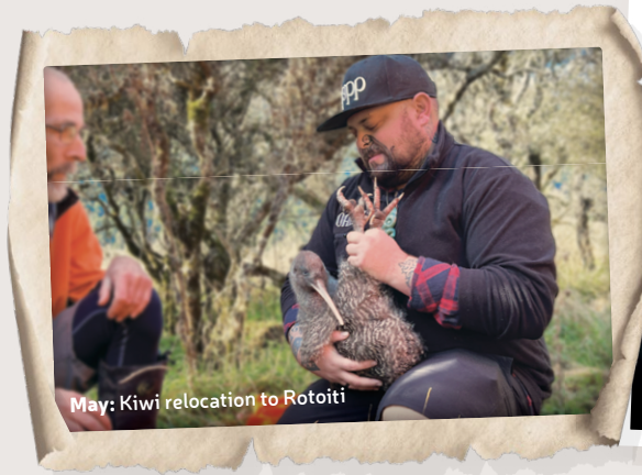
May: Kiwi relocation to Rotoiti