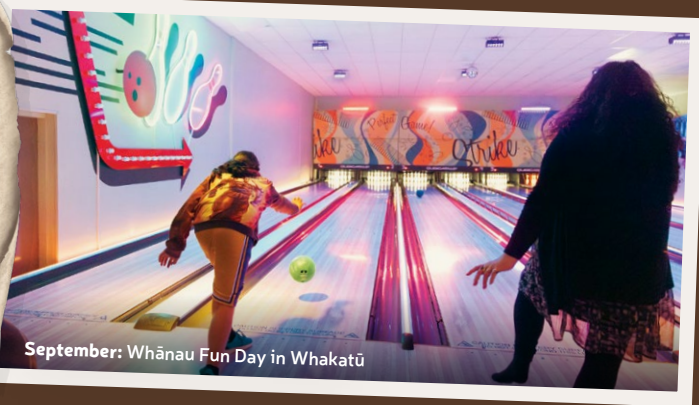
September: Whānau Fun Day in Whakatū