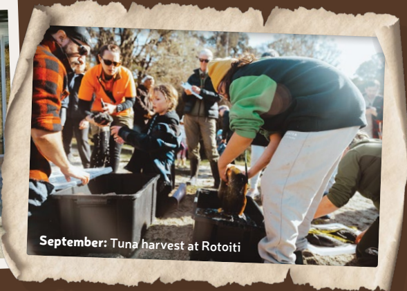
September: Tuna harvest at Rotoiti