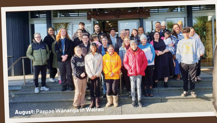
August: Paepae Wānanga in Wairau