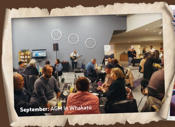
September: AGM in Whakatū