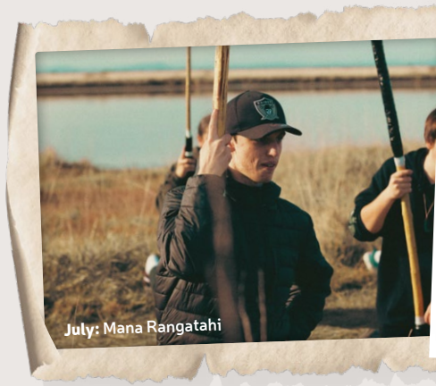
July: Mana Rangatahi