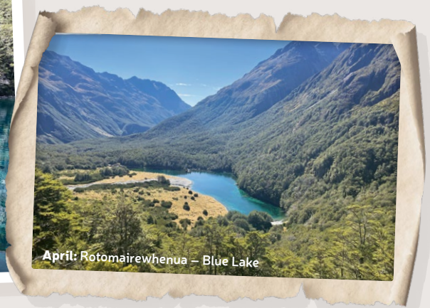
April: Rotomairewhenua – Blue Lake