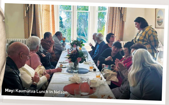
May: Kaumātua Lunch in Nelson